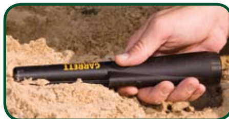
Scraping blade for searching soil