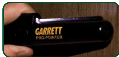
LED light assists in low light conditions

The CSI PRO-POINTER is also handy for finding objects hidden in tight spaces and for locating metallic objects in drywall.